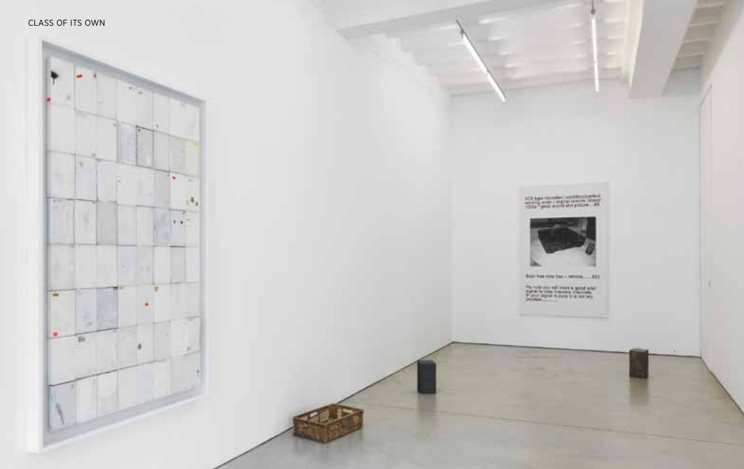
Exhibition view, 'Traces', Galerie Gebr. Lehmann, Berlin, 2013