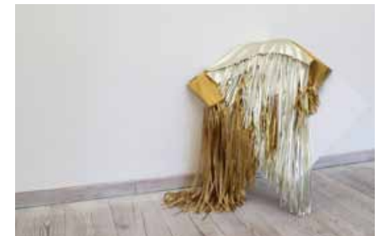
Top left: 'La seconda stanza', 2012, small bells, wood, self-locking cable tiles, small vibrating engines, motion sensor, nylon wire, 387 x 350 x 295 cm, courtesy of the artist; top right: 'Caro amore mio', 2014, digital print on tissue paper, variable dimensions, courtesy of the artist; above: 'La prima stanza', 2011, fabric, paper, tissue paper, forex, metal, variable dimensions (detail), courtesy of the artist.

group of subjects, through different materials and techniques. In other words, I like to touch different things but always in the same way and with the same set of concerns. I often find the difficulty is in immersing myself, opening up and trying to find answers. But it is only through this insistence that a real understanding of things emerges, and through them, of the self. It is precisely this permanence (in things) that I try to train every day. It is no coincidence that the term "exercise" so frequently appears in the titles of my works. For example, I have had the words of Baudrillard on my mind for days. "...If the whole secret is returned to the visible...if every illusion is returned to transparency, then the sky becomes indifferent to the earth." For me, this relates to a video project I have had in mind for some time that explores shadow – a topic already faced in some of my other works. I am interested in getting closer to what lies within it: the unclear and the hidden.