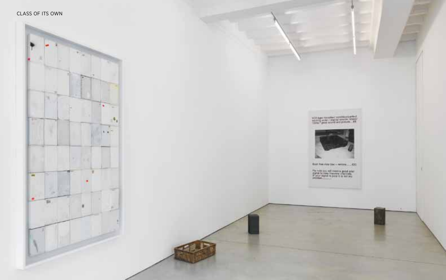
Exhibition view, 'Traces', Galerie Gebr. Lehmann, Berlin, 2013