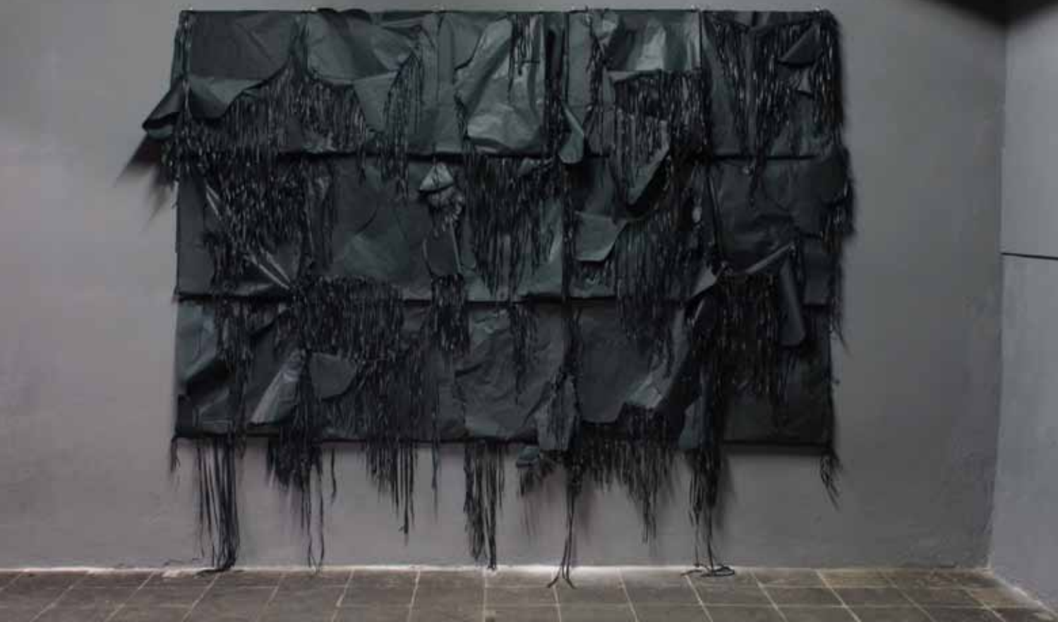
Above: 'Quindici esercizi di salvataggio', 2009, tissue paper, 160 x 280 cm, installation view: Km0, Innsbruck, courtesy Km0.